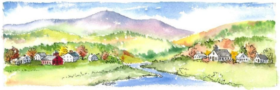
MASCOMA COMMUNITY HEALTH CENTER - COVID