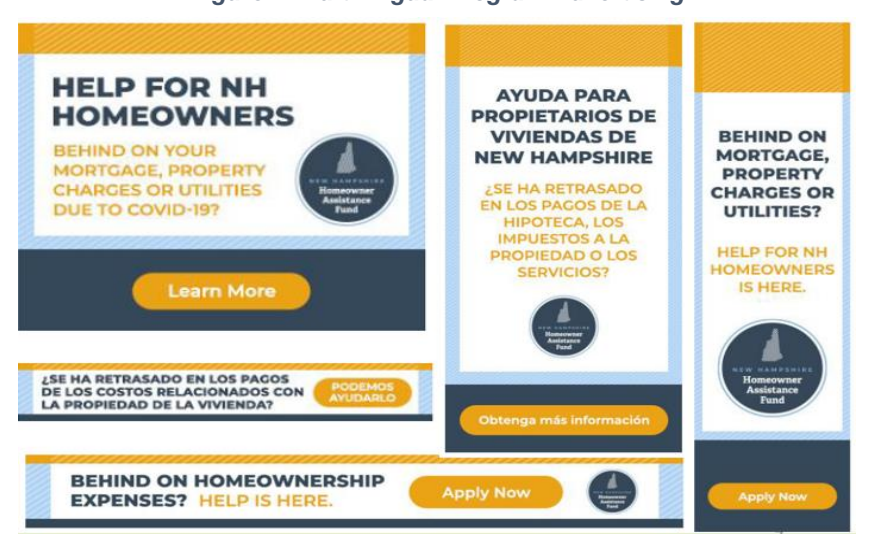
Figure 2: Multi-lingual Program Advertising

· Have incomes of less than 125% of Area Median Income